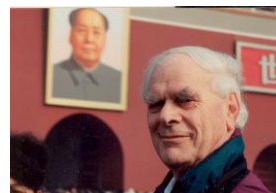
Photo:— Me, on Holiday. I call it 'Mirror, Mirror'. Photo opportunity spotted and executed, by my wife. 'Just do as you are told.' She said.